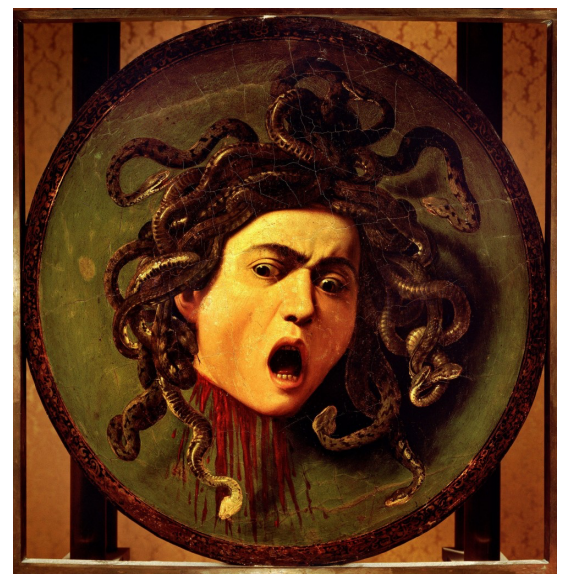
Caravaggio, Medusa , 1597; oil on canvas on wood; 24 by 22 inches. Uffizi Gallery, Florence.

Locke: The history of male depiction is about power. How do you make a man look vulnerable without making him look ridiculous? In my work, I'm much more interested in exploring that idea. What does desire look like, what does failure look like, what does excitement look like? What do those things look like? What do you look like when no one's looking at you? The tongue was a way to talk about vulnerability—standing there with your tongue hanging out because you're either lusting after somebody or you're panting after a run. It's this moment of sublime vulnerability that became really