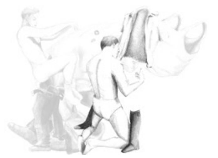
Steve Locke, the constable from the "Rapture" series, 2008.

As for the erotic part of it, I was looking at a lot of pornography and was trying to make the drawings as matter-of-fact and sexless as possible, and in some ways I