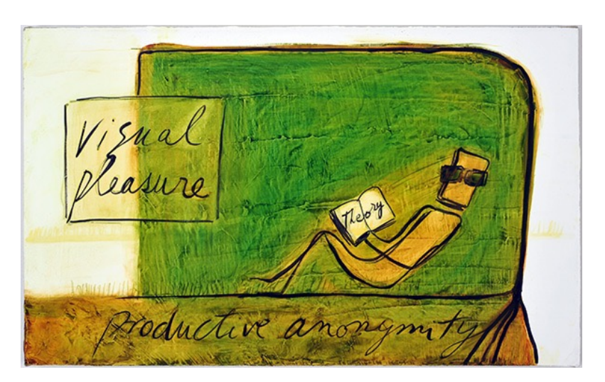
Mira Schor, Visual Pleasure/Productive Anonymity , 2013; ink and oil on gesso on linen, 18 by 30 inches.

Locke: It's part of the problem. If you're in a masters program, if