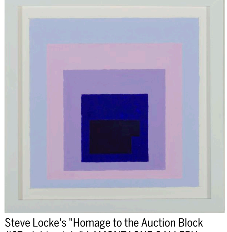
Steve Locke's "Homage to the Auction Block #27-nightwatch." LAMONTAGNE GALLERY

Paintings from Locke's series "Homage to the Auction Block" are now on view at LaMontagne Gallery.