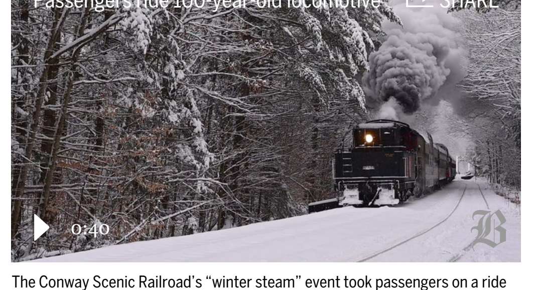
Passengers ride 100-year-old locomotive The Conway Scenic Railroad's "winter steam" event took passengers on a ride on a 100-year-old locomotive in Conway, New Hampshire.